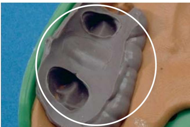
Exceeding the Working Time